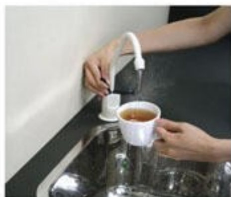
Food & Drink