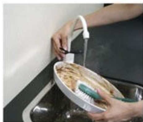
Cleaning & other uses