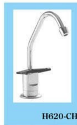
Sierra Series (Dual Temperature) 冷熱

Available in Chrome 米黃色 (H610-CH), Brass 金黃色 (H610-BR), Satin Nickel 霧沙銀色 (H610-SH), Biscuit 灰黃色 (H610-BQ), and White 白色 (H610-WT)