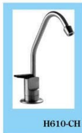
Sonoma Series (Hot only) 單熱

Available in Chrome 米黃色 (H610-CH), Brass 金黃色 (H610-BR), Satin Nickel 霧沙銀色 (H610-SH), Biscuit 灰黃色 (H610-BQ), and White 白色 (H610-WT)