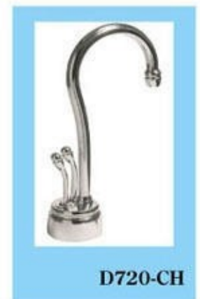
Madera Series* (Dual Temperature) 冷熱

Available in Chrome 米黃色 (H620-CH), Brass 金黃色 (H620-BR), Satin Nickel 霧沙銀色 (H620-SH), Biscuit 灰黃色 (H620-BQ), and White 白色 (H620-WT)