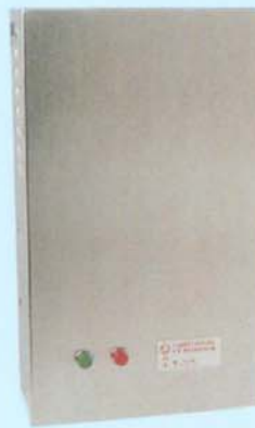
Model: MUV-100 / 180