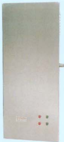
Model: MUV-1200 / 1200SP