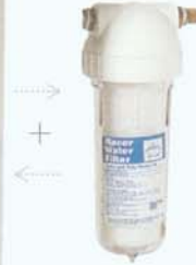
Model: SUV-60 / 100 / 180