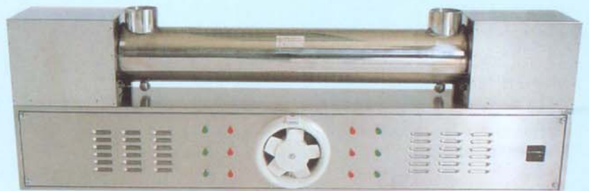
Model: MUV-1500 / 1750 / 10000 / 11000 / 12000 / 13000**