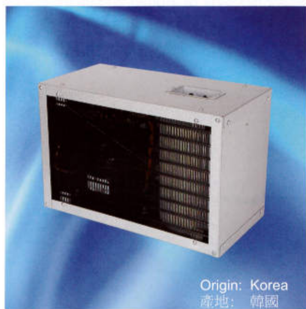
Origin: Korea 產地: 韓國