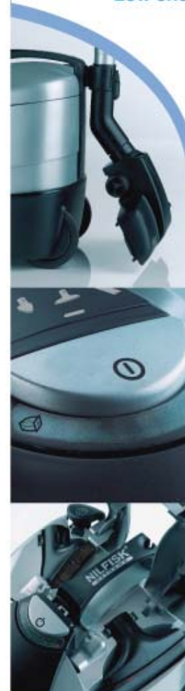
Park n stop