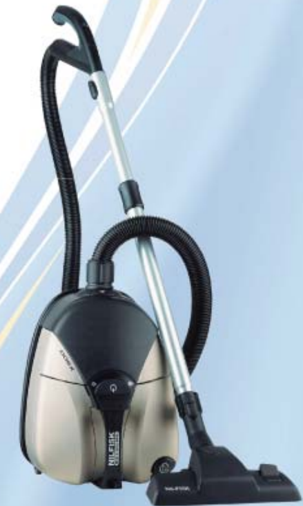
On board accessories